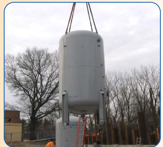
Granular Activated Carbon (GAC) vessels being delivered to Christopher Morley Park well station.

At Port Washington Water District (PWWD), providing safe and quality drinking water to customers is our top priority. The District is committed to complying with all local, state, and federal requirements to ensure its potable water supply is of the highest quality.