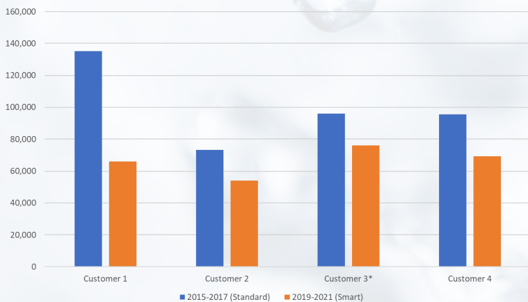
Standard vs Smart Irrigation Water Consumption of PWWD Customers